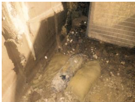
These pictures are of the two WW2 bombs discovered in London during the last six months, which were dealt with by 101 Regiment RE

Our Army Reserve elements continue to grow in confidence and capability. We have made some slight changes to the structure of the Regiment's reserve component. 221 Field Squadron (headquartered in Catford) have opened new detachments in Victoria and Bexleyheath whilst 579 Field Squadron (headquartered in Tunbridge Wells) have taken command of the detachment in Rochester to add to their existing detachment in Reigate.