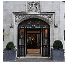
Ironmongers Hall, London

One of the new initiatives that the Company started in 2013 was that of a regular informal lunch club to be held 5 times a year in Ironmongers Hall. This has proved to be a very popular event which is almost always fully booked and provides a splendid opportunity for regular networking and outreach. Many members also take the opportunity to invite guests as we keep the cost of the event as low as possible. We do this by a careful selection of location (Ironmongers Hall, who hold a fixed price lunch every Monday and allow us to join them “en-masse”) and leaving members and their guests to decide and pay for whatever type of beverage they want to accompany their lunch. This allows people who work to return to work after the lunch and those who do not have to do so to enjoy a glass of wine with their meal and if they wish, continue to network in a nearby hostelry. The highest attendance during the last year was at our festive lunch club, held on 15 December 2014, when 59 members and guests joined together to celebrate the forthcoming festive season. It really was a splendid occasion and the Master kindly provided wine for all who attended. One of the advantages of the Lunch Club is that it has attracted some members who might otherwise not attend a function probably because – as its name suggests – it takes place during the day and therefore does not require people to travel home late at night.