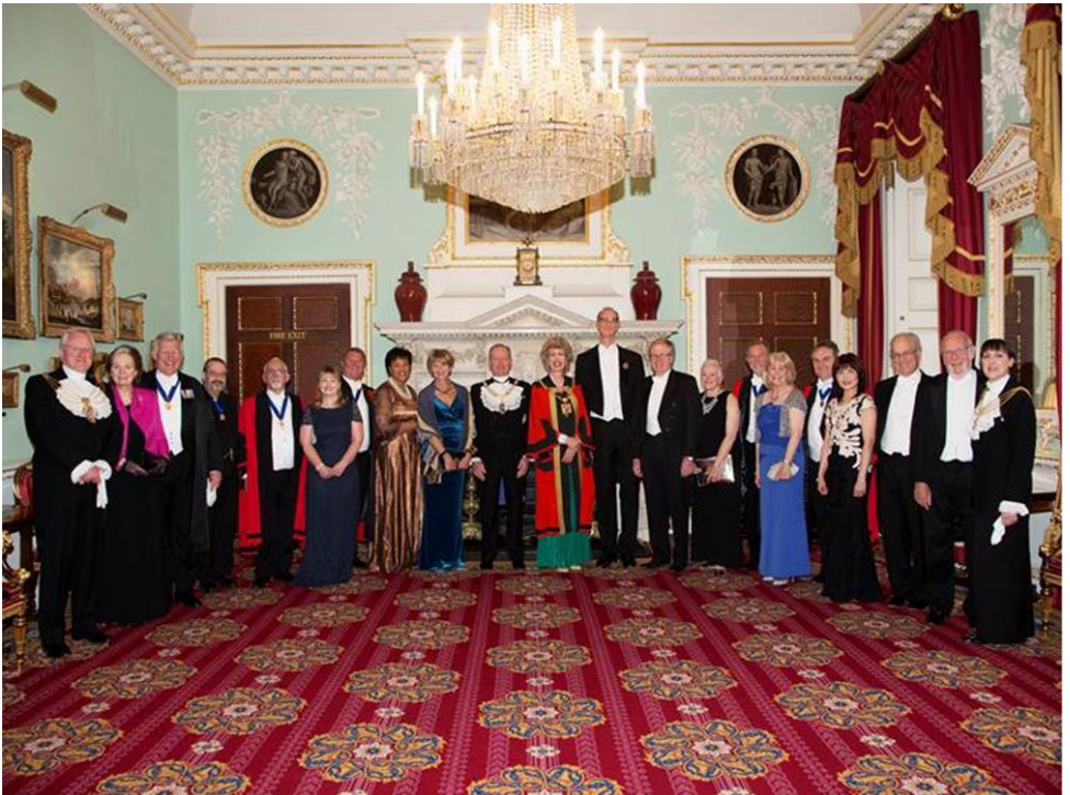
The Master, Wardens, Officers and Guests at the Sir Christopher Wren Banquet held in the Mansion House in June 2015