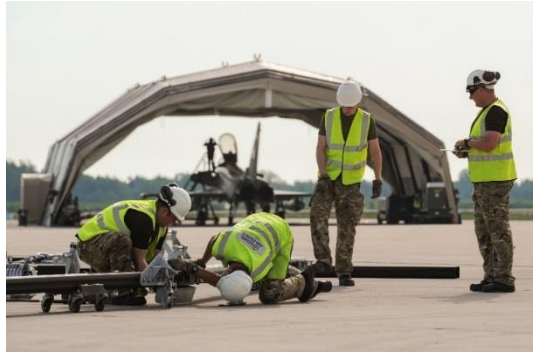
5001 Squadron at Work

The past 12 months have been amongst the busiest since the Squadron was reformed in 1999 and have seen teams from the Squadron deployed in support of every major UK military operation. At the start of the year Squadron personnel deployed in support of the UK contribution to the Baltic Air Policing mission. Deploying to Lithuania teams from the Squadron built aircraft shelters, manned the airfield runway arrestor system and provided convoy support to the Ground Line of Communication.