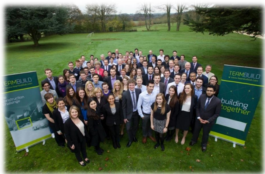
The competitors and Judges at TeamBuild 2014

The objectives of Teambuild focus on developing skills in leadership, communication and coordination beyond the sum of the of the individual's skill. The competition helps identify the way teams must work together in the construction industry by challenging them with scenarios common to construction projects across the UK.