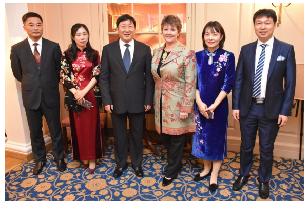
The Rugao Delegation with PM Christine Rigden - a previous Non-Aldermanic Sheriff of the City of London

The occasion was greatly enjoyed by all present and the surroundings of Innholders' Hall, although somewhat compact, together with the standard of catering, were considered to be exceptional, and whilst probably not suitable for one of our larger occasions would probably be very appropriate for one of our smaller luncheons.