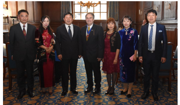
The Master and Mistress Constructor with the Delegation from Rugao