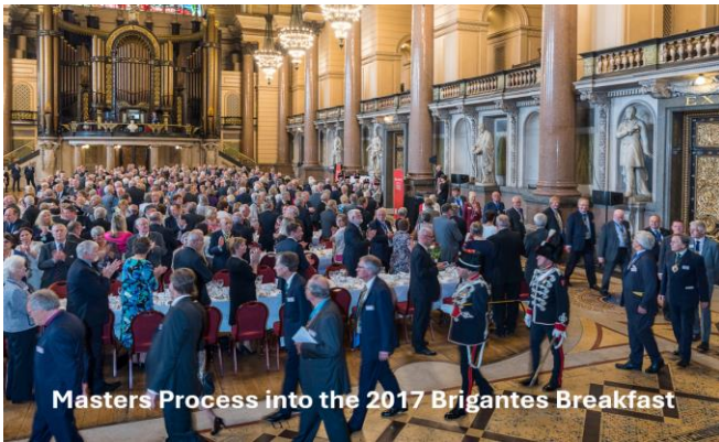
Masters Process into the 2017 Brigantes Breakfast

St George's Hall Liverpool Thursday 20 June