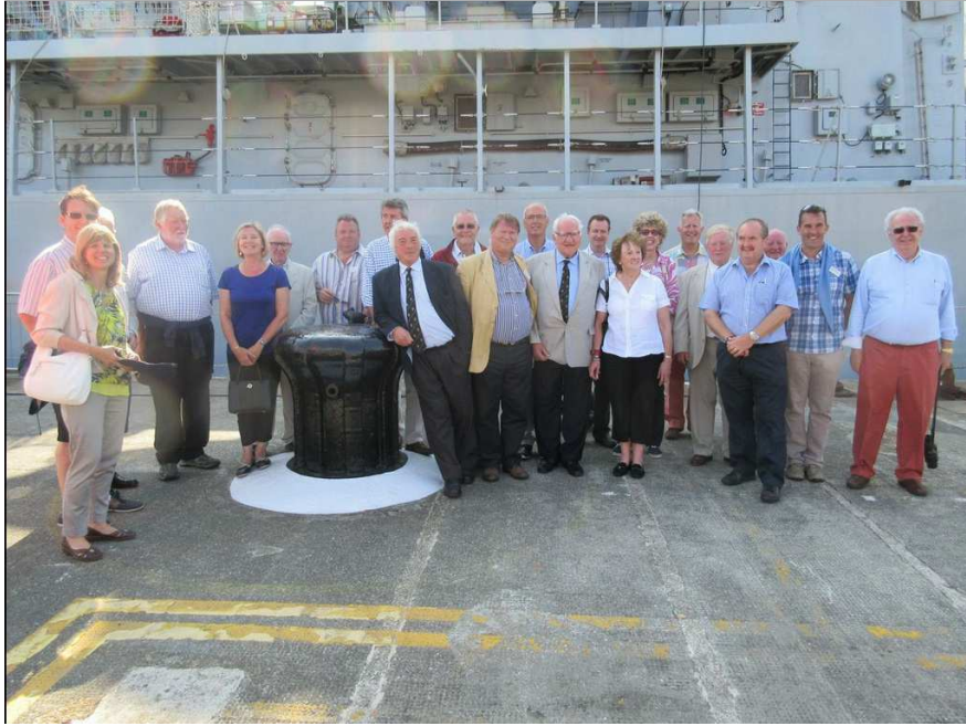
13th July - Master's Garden Party Cricket event in Croydon