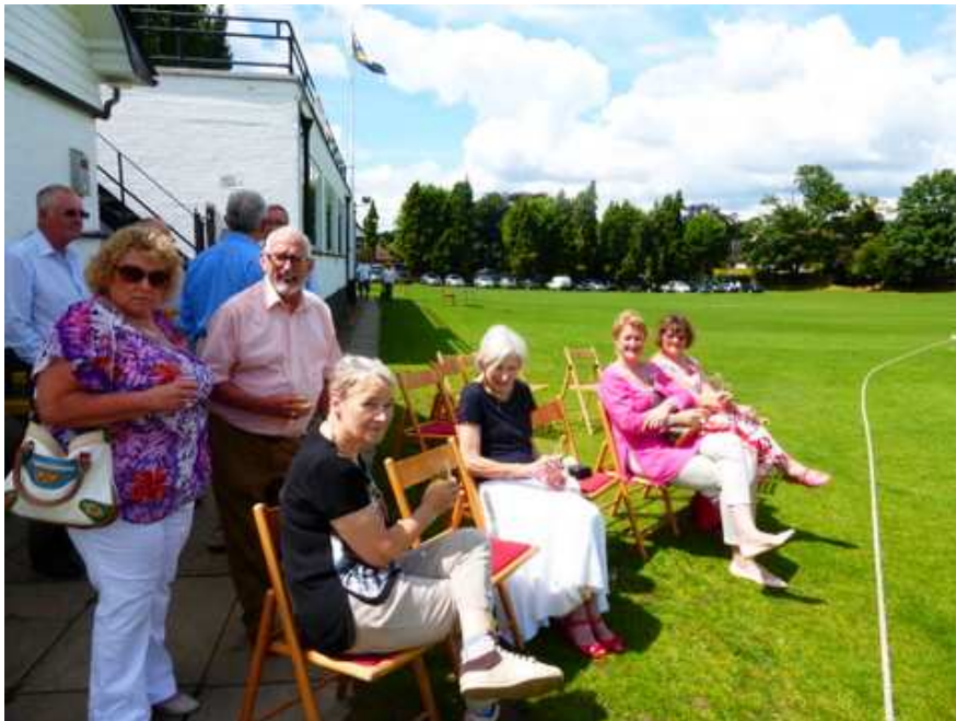
Master's Garden Party Cricket event, Old Whitgiftian's v Old Mid Whitgiftian's (Whitgift won) Cream tea with Champagne and a band was enjoyed by a group of Constructors