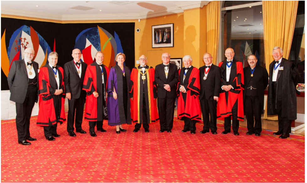
The Master, Wardens, Officers and Guests at the Installation Dinner held in Carpenters' Hall in October 2016