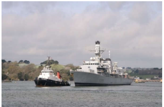
HMS Lancaster makes her way into Devonport after being towed from Portsmouth

Among the upgrades to HMS Lancaster under the programme are the installation of Artisan (Advanced Radar Target Indication Situational Awareness and Navigation) 3D Radar (improving the ship's air-defence, anti-ship and air traffic management capabilities); the DNA(2) Command System (central to the ship's capability against air, surface and underwater threats); the chloropac system (to improve performance in the ship's sea water cooling systems by preventing or reducing marine growth), an upgrade to the high-pressure air system pipework (to provide safe, reliable and flexible isolation when required), modification to the underwater inlets and outlets to reduce corrosion, and a galley equipment upgrade, among others.