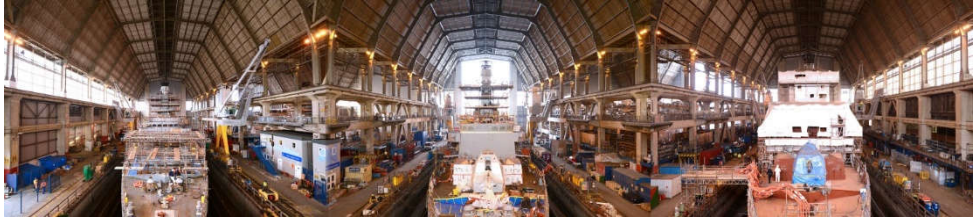
HMS Lancaster docked-down in the Frigate Refit Complex, Devonport