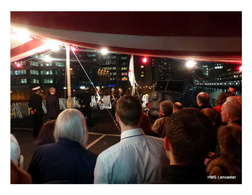
The Ceremonial Sunset at 2015pm