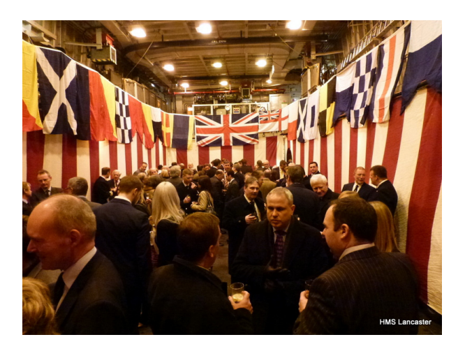
The reception inside the helicopter hanger.