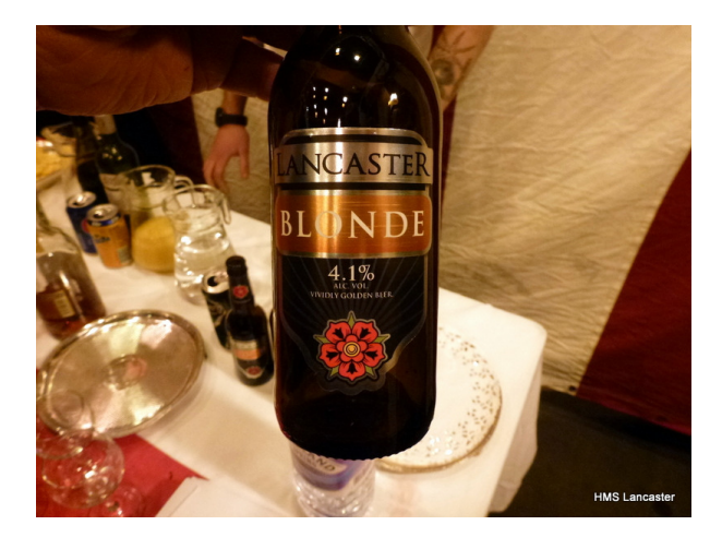
Each ship usually has its own beer - Lancasters` unique beer and label.