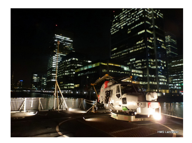
Great backdrop with Canary Wharf and ship's helicopter.