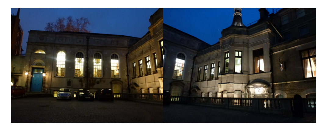
12th February - Livery & Awards Dinner, Stationers` Hall, Ave Maria Lane. EC1

The Court closed and arrangements were made for the Livery and Awards Dinner which followed.