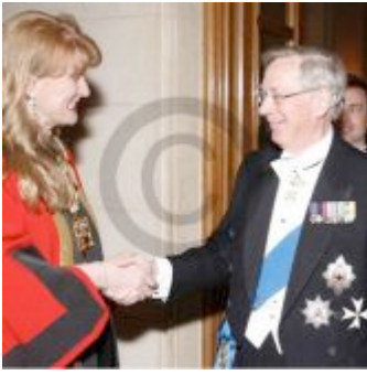
The Master Welcomes HRH The Duke of Gloucester