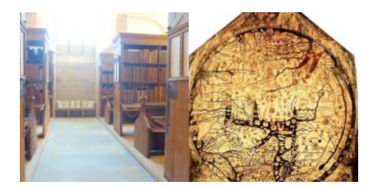
We were very privileged to be shown The Chain Library, The largest in the UK, and containing books and manuscripts dating back to 850AD,