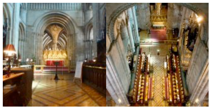
The Master had arranged four private tours by the most knowledgeable and distinguished guides in Hereford.