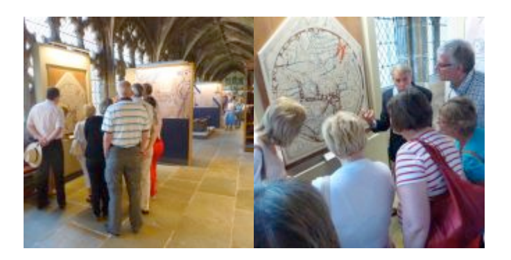
Then the Mappa Mundi together with a most interesting technical explanation and translation of this ancient map.