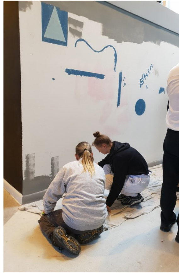
Figure III: K&M Training Centre

Case study 2 – Joe Brennan Training provide apprenticeship training to support young people to gain careers in the construction industry. Joe shared a story that JBT had noticed a young apprentice was falsifying expenses. On the surface this was gross misconduct.