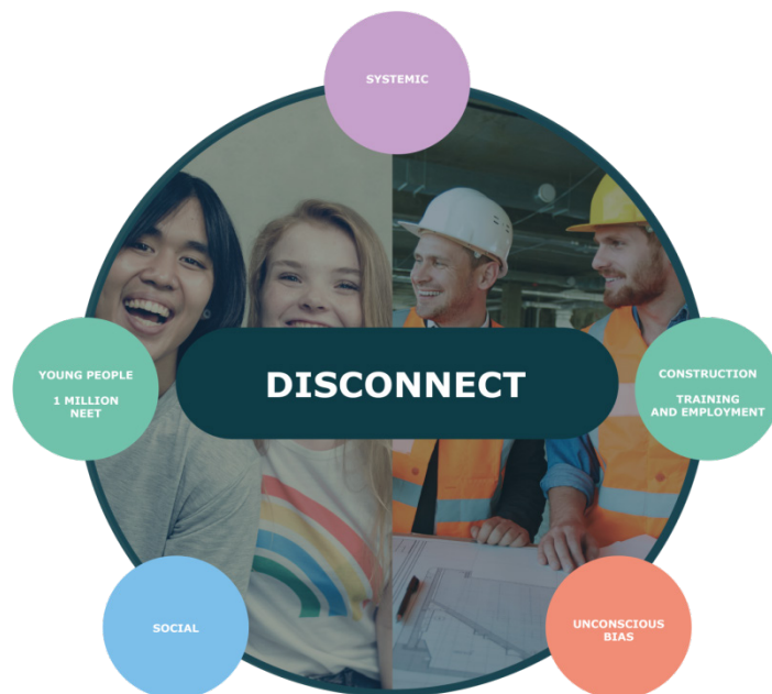
Figure II: NEETs disconnection theory

In addition to construction specific findings, the research suggests young people who are NEET are diverse and face an array of complex challenges (unconscious bias, systemic, and social) which may well create a disconnection between young people and employers.