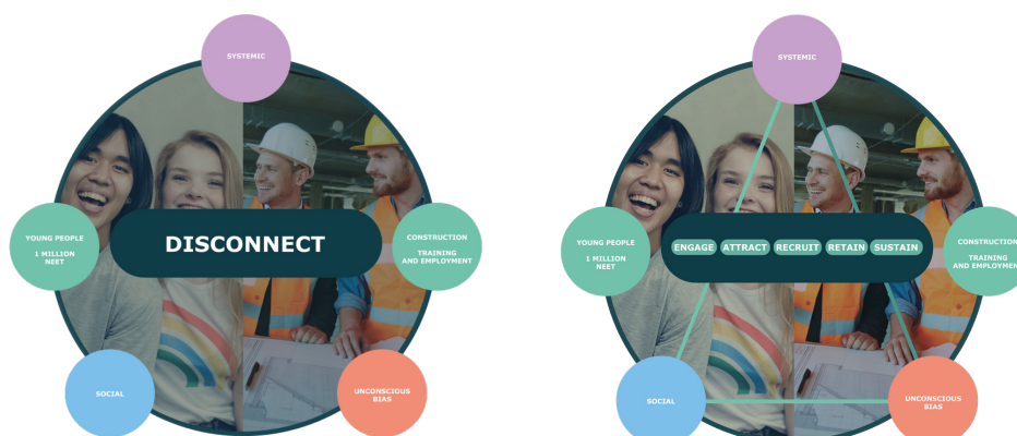
Figure VI: NEET's disconnection theory Figure VII: Framework for Engagement Theory

The below diagram visually demonstrates how this recommendation remedies the disconnection theory presented in the literature review (page 29).