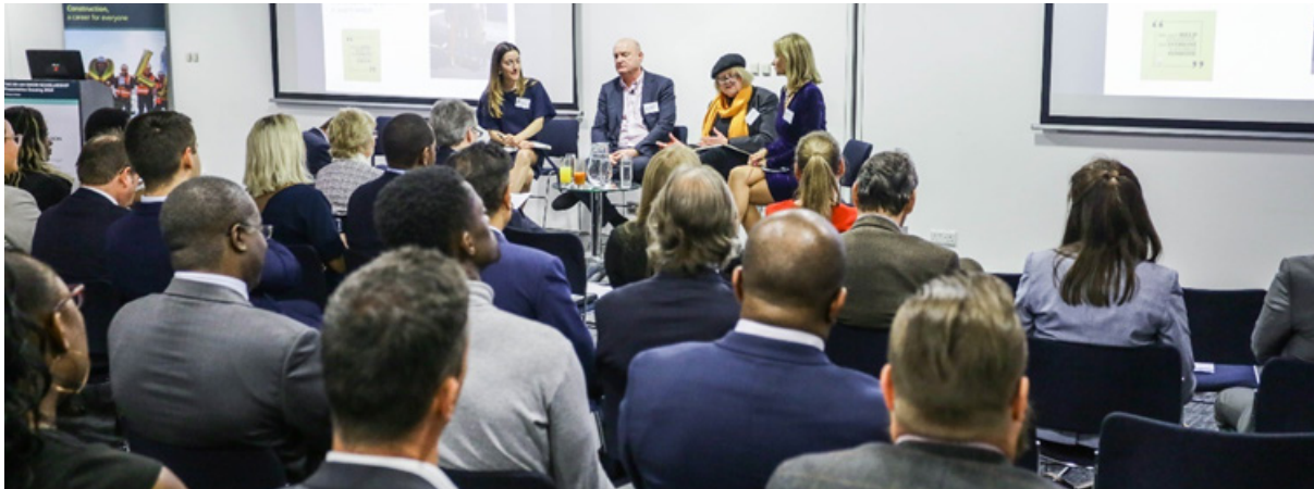
Figure V: Forgotten Youth Presentation Evening May 2019

The initial findings of this report were presented in a presentation evening at the Building Centre in May 2019. The event was attended by the professional bodies CIOB, WCC, construction companies, charities, training bodies, local authorities.