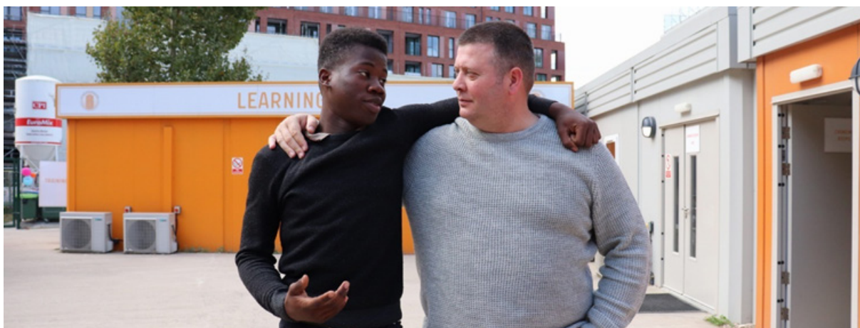
Figure IV: Student and tutor at Southern Construction Skills Centre

Their engagement with the centre had affected them so deeply that they commented the industry cared about them and wanted them to grow.